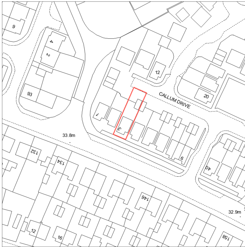
3, Callum Drive, South Shields